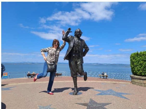
Meeting Eric Morecambe in Morecambe!

One advantage of the TD21 is it has loads of room, unlike our Healey 100/6, so we can get plenty in it. Wednesday arrived, prior to the IAW weekend and with a laden car we set off around 6am and hit the motorway. The idea was to do a steady 60mph up the M23, M25, M40, M42, M6 Toll, M6 and come off at Junction 34 for Morecambe, with plenty of stops on route. With only a couple of minor hold ups we made excellent time, arriving at our chosen hotel around 2pm.