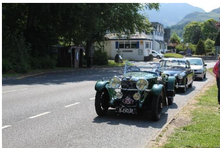
Speed 20 at Loch Earn

After a hearty breakfast on Saturday morning, we embarked on a little sightseeing of the area. As we had driven over 500 miles, we decided not to do the Longstone Tour this time, but instead have a little drive around the area, which Barbara had never visited before. We set off for Loch Earn. A really beautiful spot, where we bumped into a couple of other Alvis owners, Hugh and Candy Stirling.